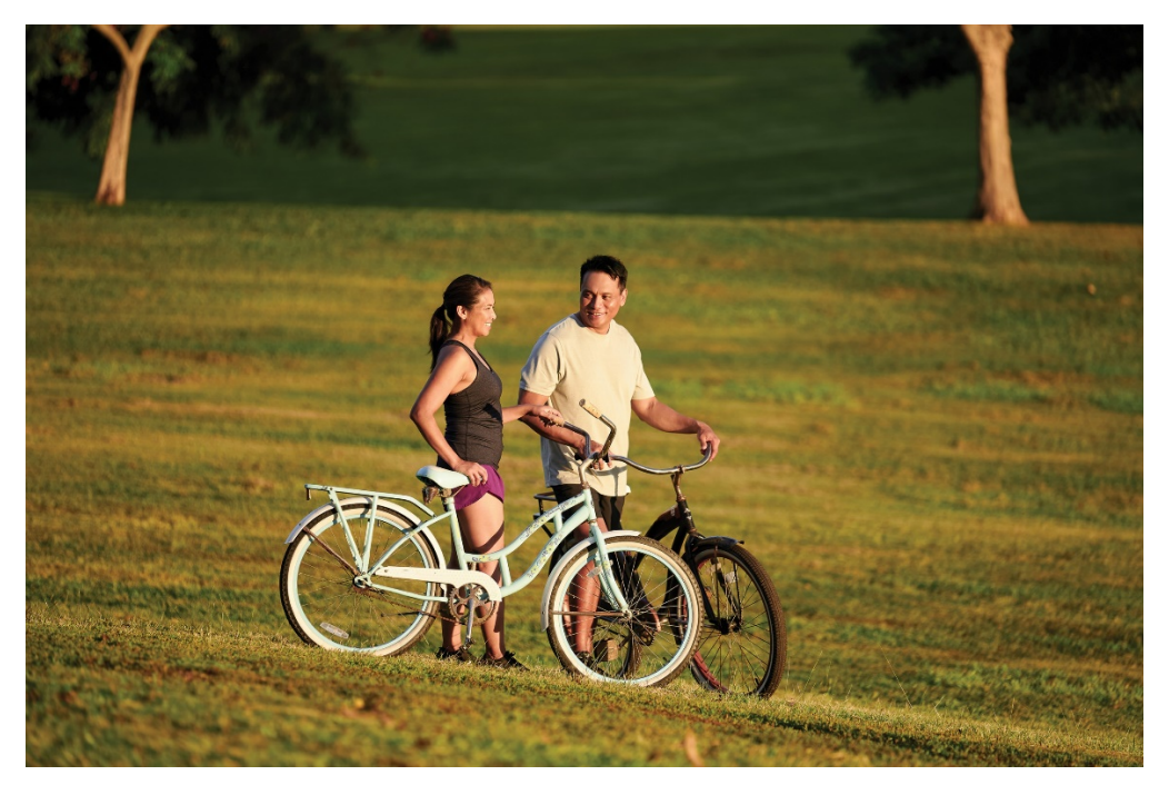
Residents can bike, walk or run through parks or along the 7 1/2-mile Hoala Trail that stretches across the entire neighborhood.

Residents will be able to walk, run and bike through Hoala Trail — the shared-use path — and utilize the mix of large and small parks that are scattered throughout. At the community's center, Hale Lau Koa — a large, open space amid all the shops and restaurants — will be a place for everyone to gather, whether it's for art exhibits, craft shows or hula performances.