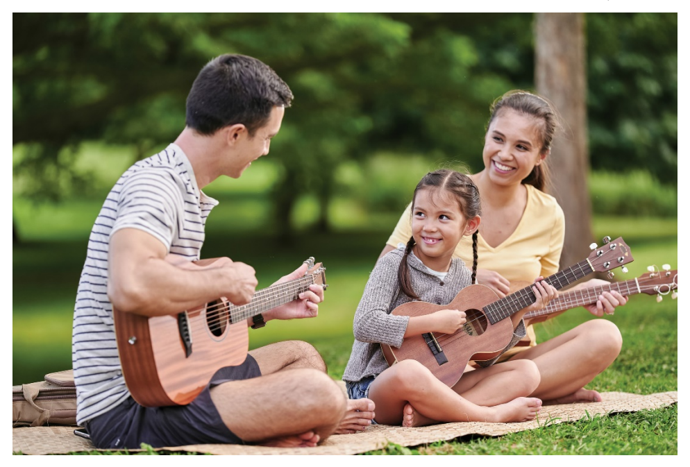
A koa ukulele is gifted to every household at Koa Ridge, as well as a certificate to follow the growth of a koa tree that's planted in their name.